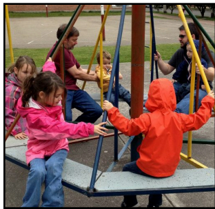
A break from house-hunting w/ the kids.

After an emotional day on September 18 th with having to say our final goodbyes, we hit the ground running on the 19 th . We had to apply for our Cédulas (the Colombia government IDs), which are required to do almost anything (ie., pay with a credit card, rent a home, establish utilities). It was almost painless, literally, except that we had to provide a blood sample because they note our blood type.