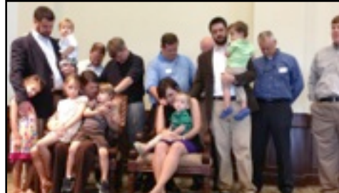
Our commissioning service at Madison Heights Church on Sept. 16th

It is hard to believe that we are writing our first newsletter from Bogotá, Colombia. It has been a long journey getting here and in many ways it is out of the frying pan and into the fire! Since arriving at the airport on Tuesday, September 18 th until now, it has been a whirlwind of activity for our two families. We thought we would share a little bit about what missionaries go through as they transition to the mission field.