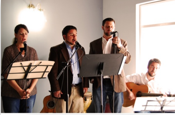
Our team leading worship at Refugio

team and take measures to refocus our efforts for the good of the church and for the glory of God. It is through El Refugio that we are able to receive hands-on training in cross-cultural evangelism, discipleship, and church leadership.