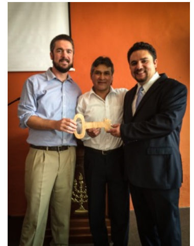
Handing over the "key" to the church

This month has already proven to be very exiting. A young pastor-in-training who had asked us to help him with a ministry to youth, returned from his seminary education. Excited to get to work with these youth, he jump right back in where he left off. Knowing that we were going to have our hands full with the church, and that our goal is to have local ministers pastoring these ministries, we were happy to have been able to play a foundational roll in the lives of these young people and to hand off that ministry to a local minister.