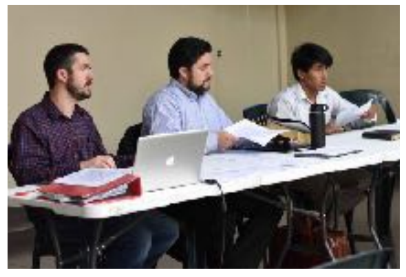
Getting down to (church) business.

As you may know, our hope is to see Peruvians pastoring and planting their own churches. We want to be instruments of discipling and training these pastors. Those plans were drastically changed when we arrived in Arequipa and were asked to pastor a local congregation. Of course it was not our original plan, but God has used this experience in a thousand ways. We have learned so much serving this congregation. We have seen