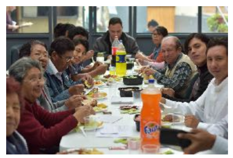
It wouldn't be a true Peruvian meeting without sharing a meal.

Our hope is to have a Peruvian pastor identified by the end of 2018 and see some Peruvians stepping up to the task of the leadership of the church. We are slowly implementing a strategy to see this happen, but ultimately, it is in the Lord's hands. We cannot change hearts or call people to the ministry. We simply want to be faithful to what the Lord has called us to. Please pray for the Lord to raise up leaders in this church and that we may transition well. This is by far the hardest part of ministry in a foreign culture.