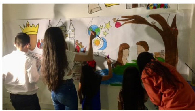
Kids painting the Big Picture of the Bible