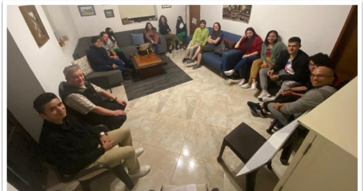
First Youth Group Meeting