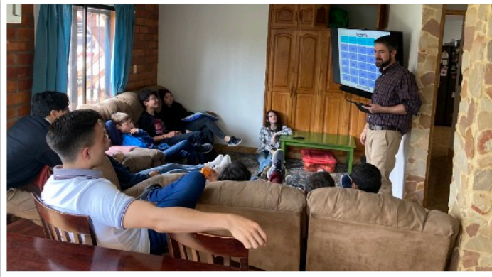
Lunch with 10 youth who are in the membership class