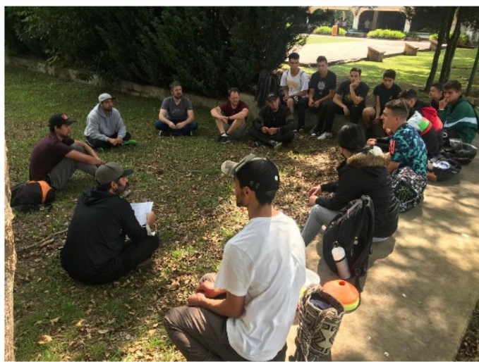
Ultimate Frisbee pre-game huddle