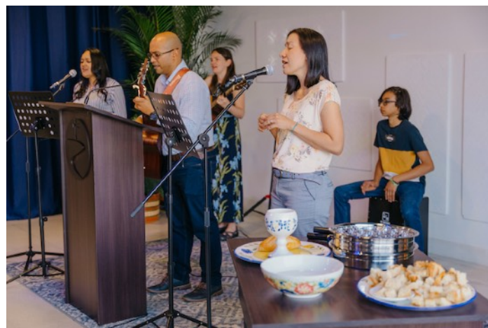
Our worship team