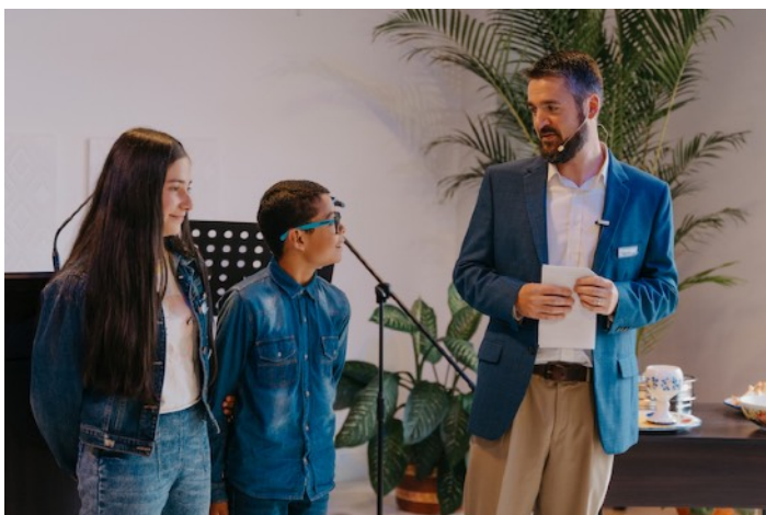
Youth making a profession of faith.