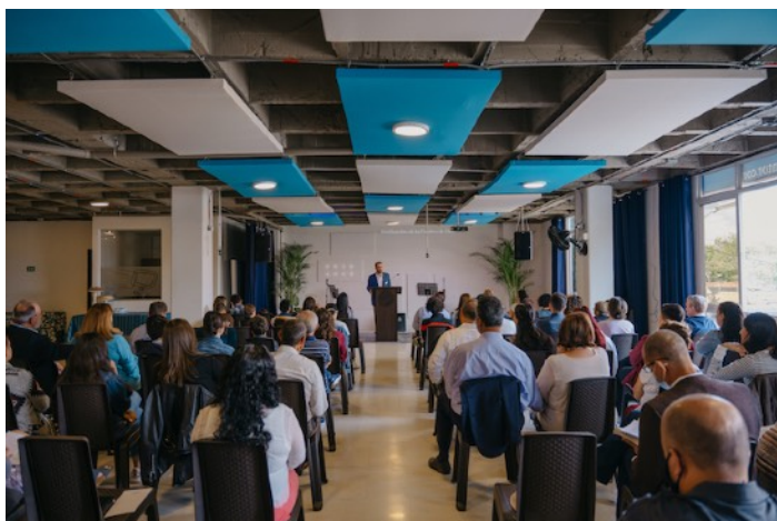
Lord's Day Worship - April 17, 2022