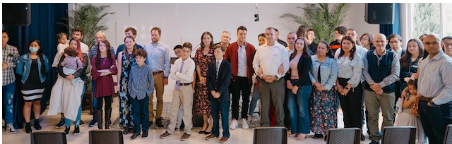
Iglesia El Redentor's First Members (this is almost all of them.)