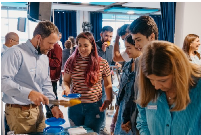
Reception of celebration after the worship service