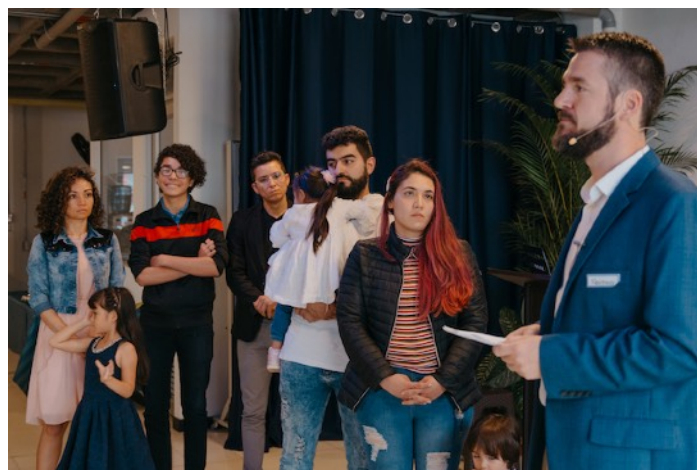
Preparation for covenant children baptisms