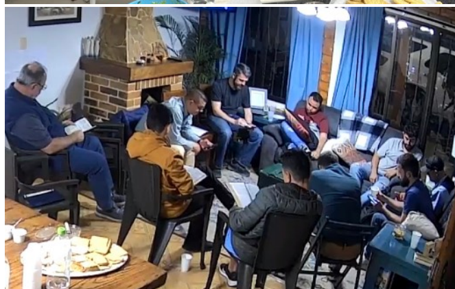
Women’s (above) and Men’s (below) ECO groups.