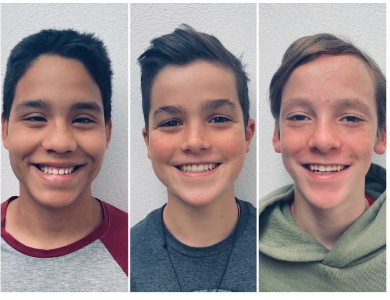
I had to take some updated headshots of the cards recently for an ID card. I am overwhelmed on a daily basis by how fast it all goes. They're so old!