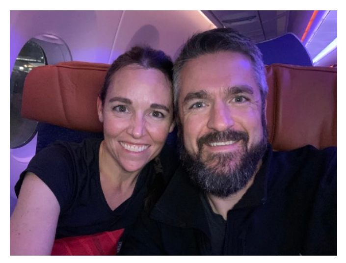
This is how we spent most of November. In an airplane. Over 60 hours in airplane seats (and not even including airport time!) At least it was good company!