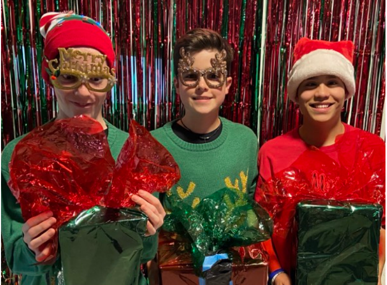
The boys in the photo booth at the church Christmas party.