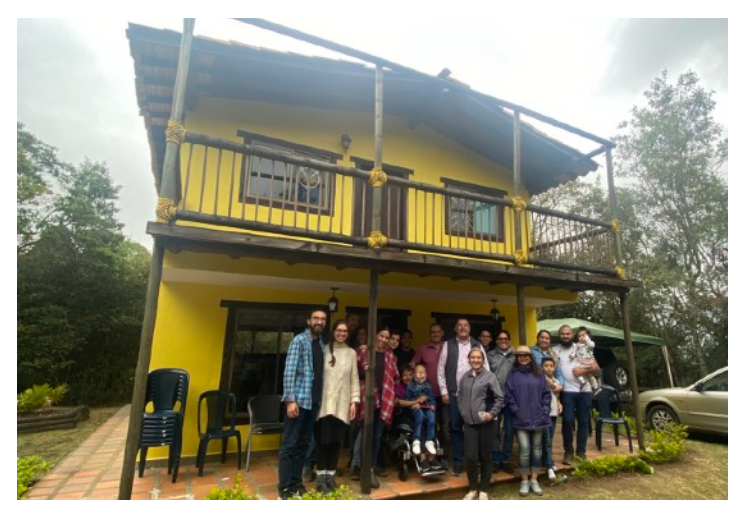
Another fun Christmas celebration with a group of local pastors and their families from various denominations who are in ministry across our region.