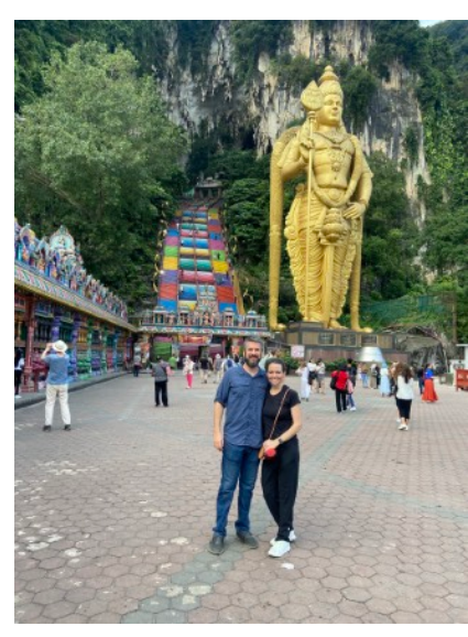
The rainbow-colored steps in the background lead to the cave, the temple, and a huge tourist area.