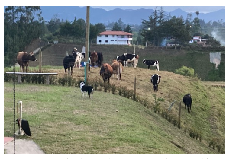
Bruno (our fearless pup) protecting the homestead from the invading beasts on the other side of the fence.