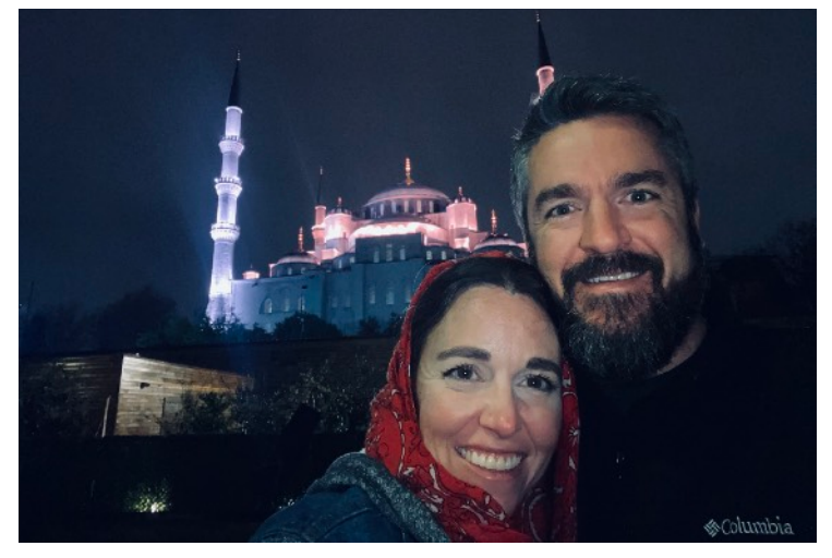
We had a long layover in Istanbul and took advantage of the chance to see some sights. This is in front of one of the Blue Mosque.