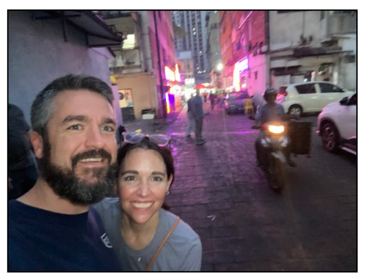
Highly jet-lagged but happy to be on the ground and walking through the streets of Kuala Lumpur, Malaysia.

Well, we didn't actually take any trains, but all of the extra time in planes and automobiles more than makes up for it! In November, our family spent a significant amount of time on the roads and in the skies. We dropped the kids off in the US to spend some time with both sides of our families while we traveled to Malaysia for an MTW leadership conference. Our time there with our coworkers from across the globe was encouraging and challenging, and we were thankful for the opportunity for some dedicated time to think through various ministry components and strategies.