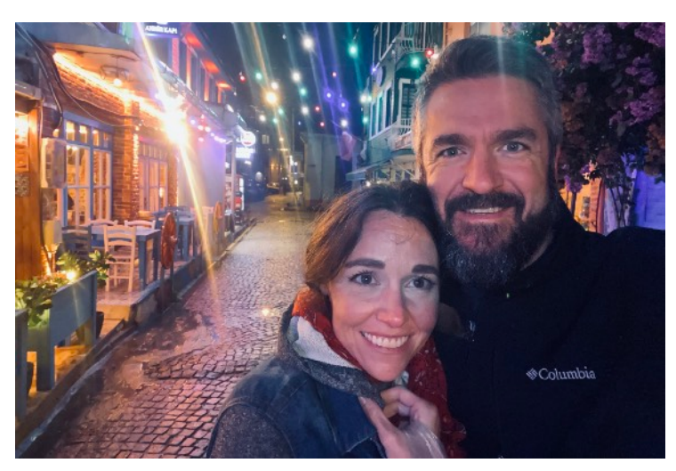
The streets of Istanbul at night. We have decided that we LOVE Turkish food! We hope to go back for more than just a layover someday.