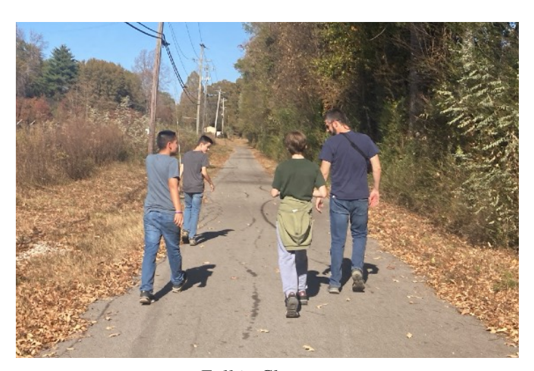
Fall in Chattanooga.