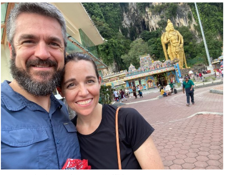
We had one afternoon "off" from meeting in Malaysia and we went to a visit a famous Hindu temple inside a cave. It was very interesting to say the least!