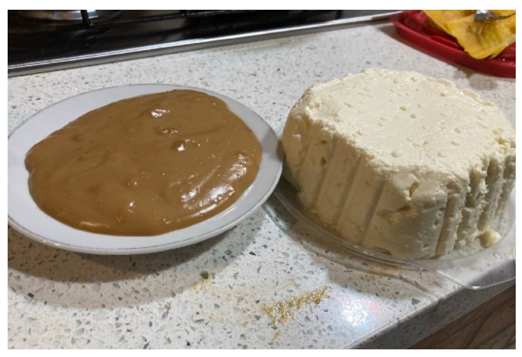
One of our neighbors here at the new house has about 70 hens and sells us eggs and arepas each week. Sometimes she makes some extra items to sell to the neighbors too, and we area always up for buying whatever she cooks up in her kitchen. This is natilla and cuajada.