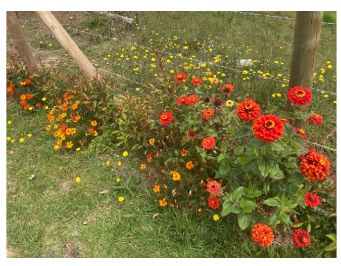
One of my favorite things about Colombia. Beautiful things pop up everywhere. I didn't plant these, but they're growing along my fence. I love it.