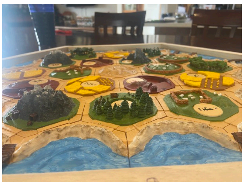
Over new years we kept our annual tradition of the Lord of the Rings trilogy over several days, and we also broke in our new homemade Settlers of Catan board that we built and painted. It turned out pretty good! It was nice to have a low-key New Years celebration as a family after a busy Christmas season.