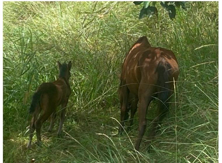
We've had a new baby horse show up in the last couple of weeks. We have loved living next to all of this land that is rented to cattle farmers. It is always fun to see what is outside our fence on any given day.

Thanks for reading along! We always love to hear from you as well. Please reach out and let us know what your family is up to.