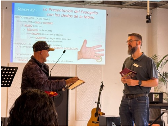
The church recently hosted an Evangelism Explosion workshop, and hopefully we will soon be able to start the more in-depth training classes as well. We are hoping this will be a great way to get our congregation involved in intentional evangelism here in Rionegro.