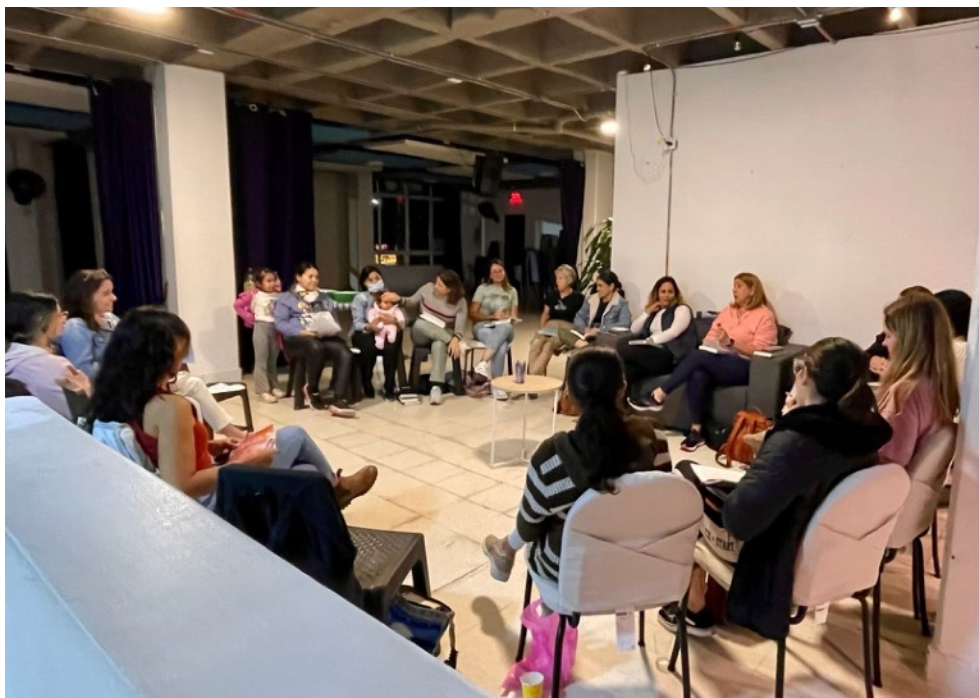
Our men's and women's groups started back in February as well. Both groups are studying The Meaning of Marriage by Keller.