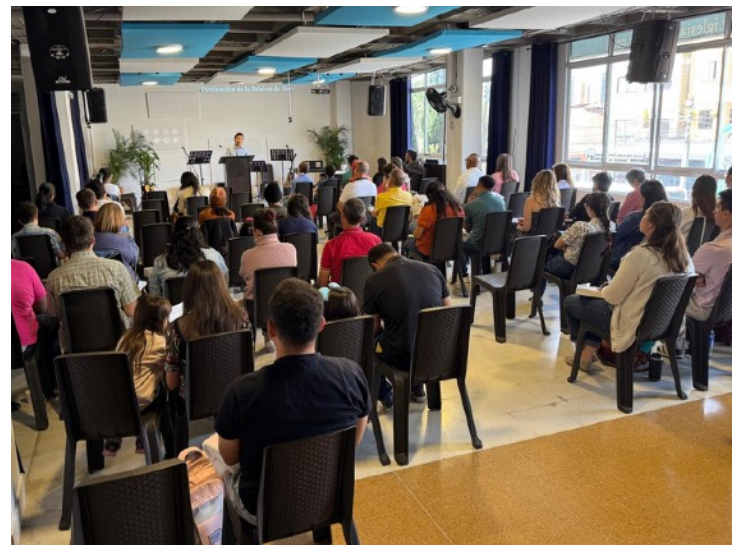
Sunday mornings at El Redentor

With this in mind, this newsletter will be a report of sorts from our own Department of Missions Efficiency (D.O.M.E.). It is important that you have an idea of where your financial support is going. It is also important that we, as your missionaries, think about this as well. Why? Two reasons. First, we need