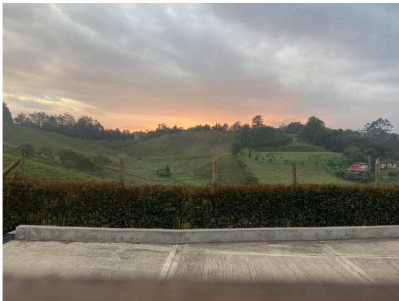
Instead of a back porch sunset pic, here's a front-door sunrise pic. It's often so foggy in the early mornings that you can't see the view, so getting a glimpse of the sunrise is always a treat!